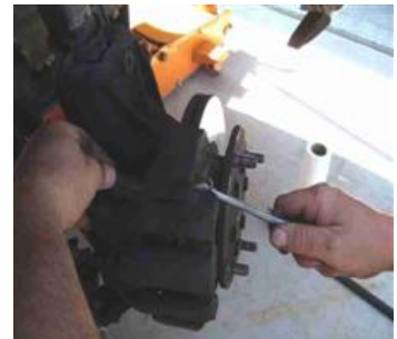
Take the pressure off of the top shim and slide it out the back. Note how it is installed as it is easy to get it turned around.