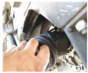
Pull the boot off of the tulip. If it is cooked on, this may take a bit of effort. Also, it is full of grease. Get a roll of cheap paper towels, you will need them!