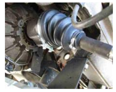
Here is the inner boot banded in place, the large band being that tbolt, and the small band being another of the screw type fuel line ones.