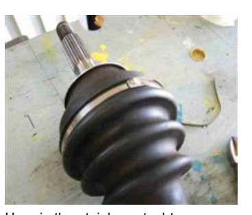
Here is the stainless steel tywrap on the outer boot. It is pulled tight with pliers then bent back over itself. Then it is tapped lightly with a ball peen hammer to flatten as much as possible.