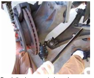
Break the lower control arm loose from the wheel hub. You might have to use a pry bar to do this. If so clean it up so save yourself some grief on reassembly. Note that this picture was taken after the axle was removed, but it still is the same action.