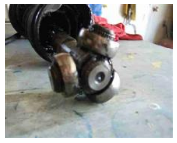
Exposed slider bearing with circlip at end. Clean the excess grease off, but don't go overboard. Unless there is obvious hot spot discoloration, or visual damage, you don't want to strip all the grease off of these