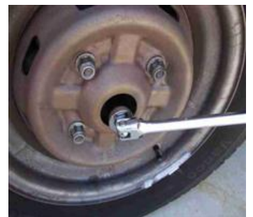
Put the tire back on, take the rig off the jackstands, and torque the 30mm nut back on to approximately 175ft/lbs.