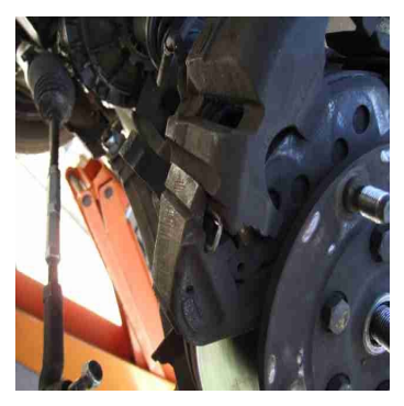
With the shims out drop the caliper down and you will have clearence at the top to rotate it out. You don't have to remove the pads, but this is