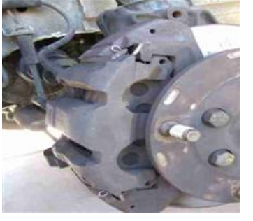
Replace the caliper by doing the removal instructions in reverse. Be sure to get the small clips in place.