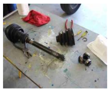
Here is the axle with the slider bearing and inner boot removed.