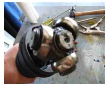
After checking the clearence, continue assembling the axle. Shown here is the slider bearing,circlip, and the outer boot reinstalled. Be sure to align the bearing using the marks you made durning disassembly.