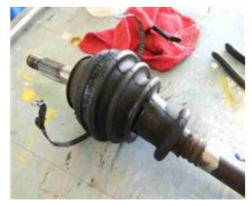
Cut the bands off the outer boot.