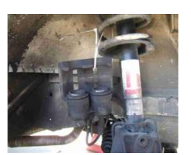
Get a cheap tywrap and hang the caliper up. Saves replacing the brake lines.