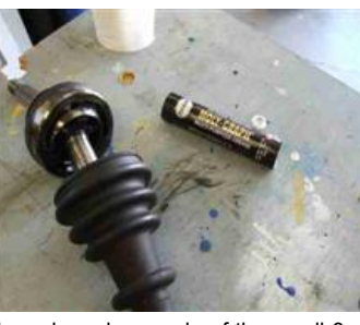
I purchased a couple of the small 3 oz., 6" long tubes of the Sta-Lube Moly Graphite grease from a NAPA store, but you can get it anywhere, like WalMart, etc. I used this instead of the grease that came with the boot. Takes a full tube per bearing. Fill the boot up, then slid it over the bearing race and put it in place.