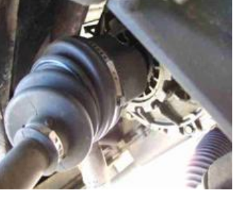
This is a picture of the inner slider joint "tulip" with the boot banded on. Get a set of side cutters and clip the large outer band.