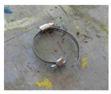
Since I couldn't find a 1 1/4" diameter fuel line clamp, I put two of the 3/4" ones together as shown.