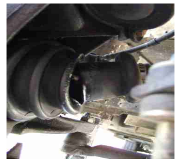
This is the type of damage that a tire recap will do if you hit one at night doing 65mph. Also scares the hell outa' ya! This damaged boot was the reason for pulling the axles and replacing the boots. Since I had to do one, I went ahead and did them both.

Email me if you have other questions at jvrsw@comcast.net