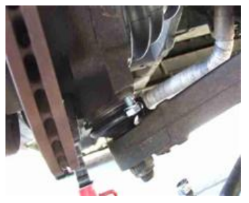
Secure the ball joint back in place with the new hex head bolts. Again, these are 8mm X 1.25 X 20mm hex head bolts that have a 13mm head.