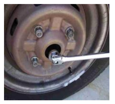
Before putting the LS on jackstands, break the 30mm locknut loose on the wheel hub. Once you have loosened the nut and it is almost off, tap it with a board and hammer to break the spline loose. You should have about 3/4" of lateral movement in the axle.