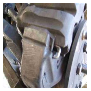
This is the bottom shim. There is not enough room to slide it out, so use a screwdriver and gently pry the caliper upwards until this shim is loose.