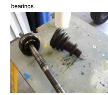
Slide off the old boot and clean up. Same as the slider end, inspect for damage. Don't remove all the old grease unless it is hardened or contaminated. Work some new moly grease into the balls and through out to make sure there is plenty in the outer bearing housing.