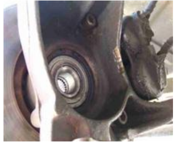
Clean up the wheel hub of old grease. Insert the axle before you put the inner boot and slider bearing on and spin to check the clearence of the outer boot band. You might have to grind off a bit of metal, as I did on the area shown near the caliper, to get the best clearence. A Dremil comes in handy.