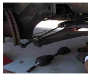
Axle out of tulip and hub. Beer break......