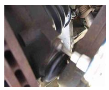
This photo is a bit out of focus, but you get the idea. Use the 10mm Torx driver to remove the two bolts that hold the bottom ball joint to the wheel hub. I replace the torx head bolts with a standard 8mm X1.25 X 20mm hex bolt, .