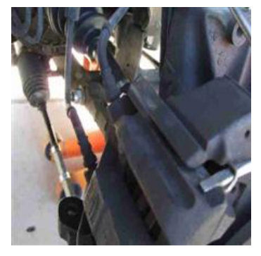
A second shot of the top shim. Note that the spring(where the screw driver is) goes under the caliper.