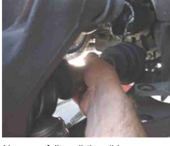
Now carefully pull the slider bearing out of the tulip. Later you will clean the tulip up, but for now you will have your hands full of the axle. Cover the tulip with a plastic bag to keep dirt out.