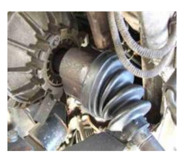
Work the inner boot back on. Note the 3 indentations and how the boot aligns with them.