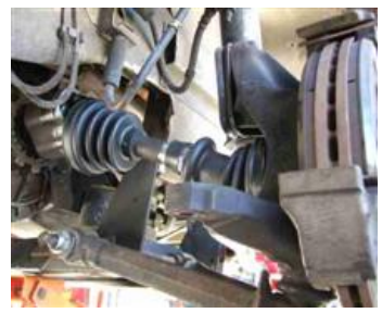
Should now look like this.