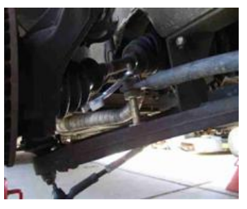
Disconnect the torsion arm bolt. If the rubber is worn or damaged, go buy a set of 1" polyurethane replacements from any parts dealer. This is the time to do it.