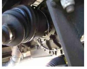
Here is the picture of the old outer band cut loose.