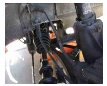
Place the slider bearing back into the tulip. Line up the marks you placed on both durning removal.