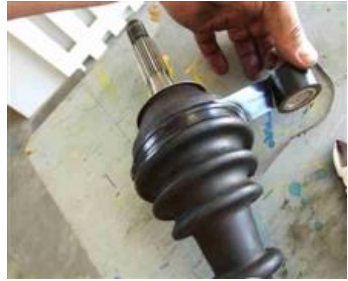
I then wrap a high quality electrical tape around the band and insert it into the wheel hub for a clearance check. If there are no scrape marks on the tape, then the clearance is good.