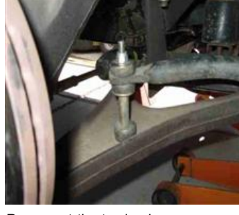
Reconnect the torsion bar.