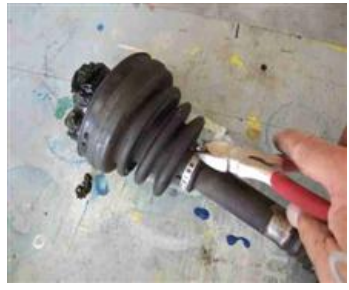
Cut the small band from the inner boot and slide the boot back. note the ridges on the axle. When reinstalling the boot these will be important to remember.