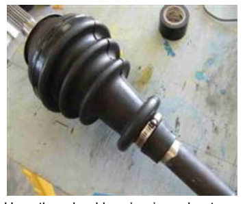
Here the wheel bearing inner boot clamp is in place. Tighten just enough so the boot won't move.