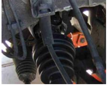
Mark the orientation of the axle to the tulip. Pull the boot back to expose the bearings. At this time verify that the splines are loose on the wheel end. if they were not, things will get ugly real fast.