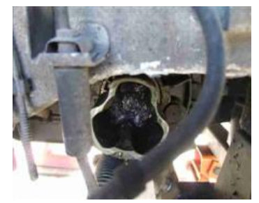
Clean the majority of the old grease out of the tulip still on the tranny.