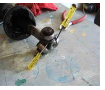
Carefully work the circlip off. Be careful, as it will fly away and you will be looking for it for hours! Mark the orientation of the slider bearing on the axle for reassembly purposes.